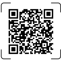
MN Statutes 115a.93

In Olmsted County, licenses are required for anyone engaged in the collection and transportation of solid waste by Minnesota law ( MN Statutes 115a.93 ) and the Solid Waste Management Ordinance ( Olmsted County Code of Ordinances Chapter 3500 ) and the Designation Ordinance ( Olmsted County Code of Ordinances Chapter 3550 ). This includes individuals or businesses engaged in waste collection and cleanup services or junk haulers. Services cannot begin until the appropriate license is obtained, and licenses must remain valid at all times.