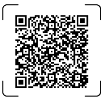
Solid Waste Management Ordinance