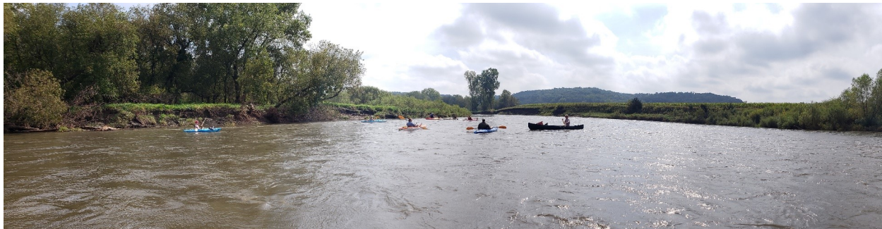
Zumbro River Downstream of the Green Bridge (A stop on the Zumbro River State Water Trail )

You are invited to “Waterside Chats” located in 3 communities throughout the watershed. Priority resources and issues have been identified from local and state plans, studies, reports, state agency feedback, and resident surveys. Now, we need your input on the prioritization of these water and natural resources issues! Your feedback will be used to formulate the final list of priority issues that will be addressed in this 10 year plan.