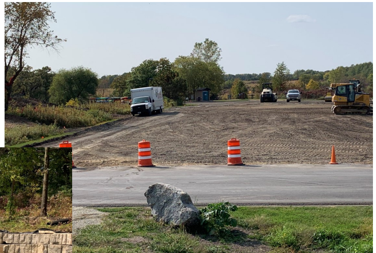
Above: Boat launch parking lot under construction.