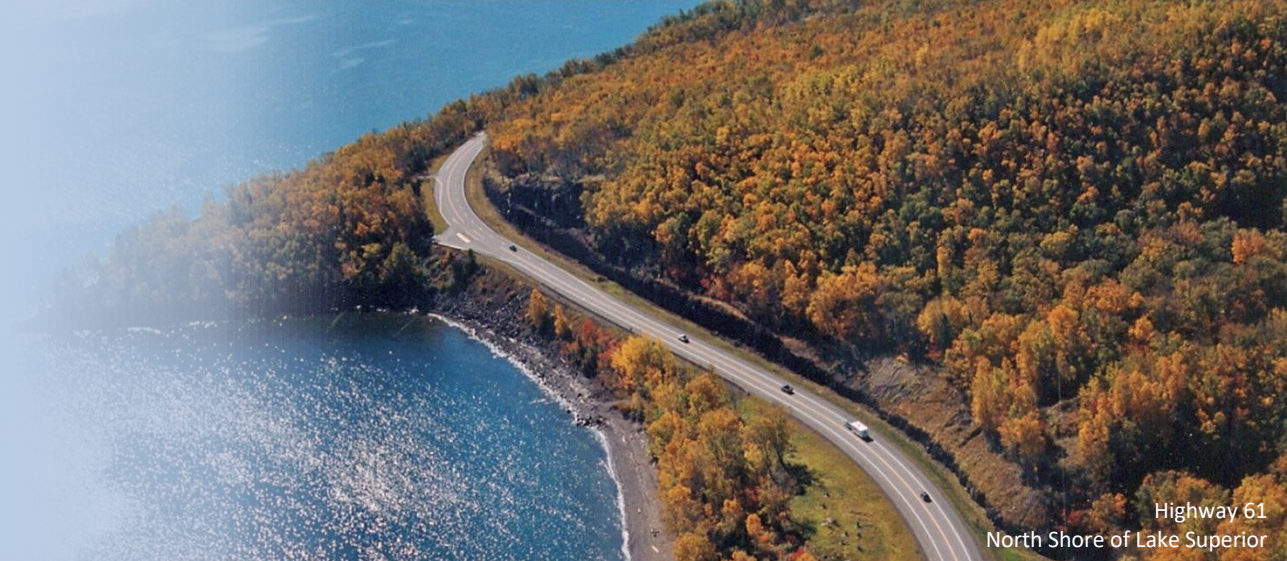
Highway 61 North Shore of Lake Superior