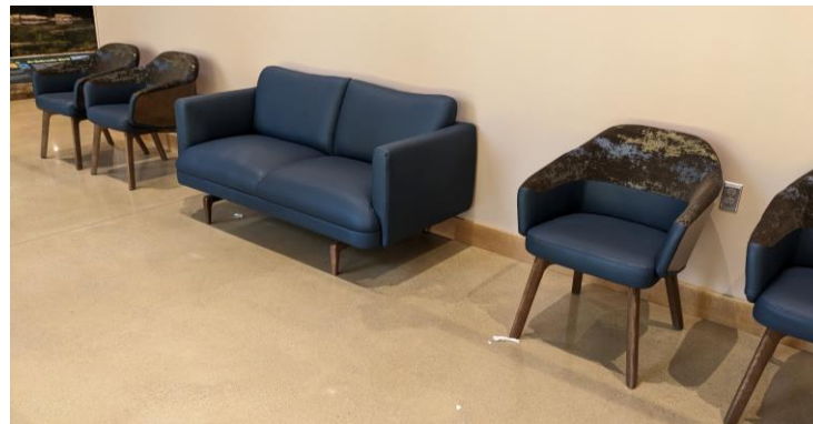
Wildlife Viewing Area Seating