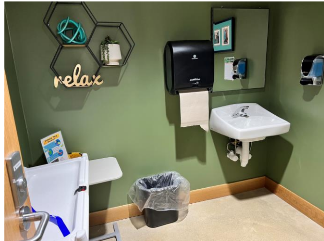
Mother's Room/Quiet Room