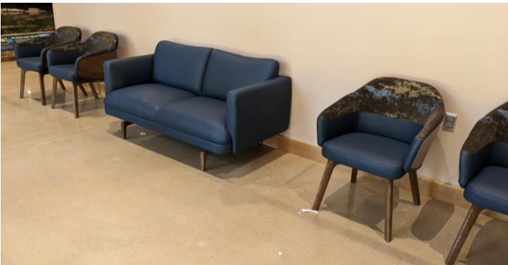
Wildlife Viewing Area Seating