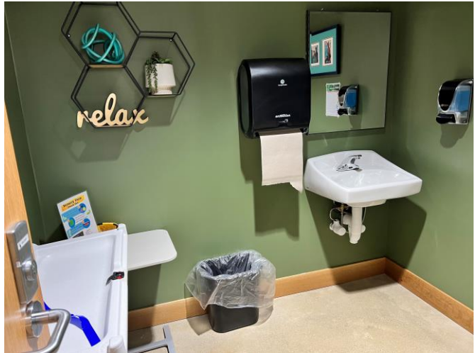
Mother's Room/Quiet Room